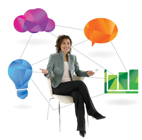
Our integrated approach puts our clients' customers in the center.

Growth Services: Our award-winning Growth Services help clients create and deploy integrated sales and marketing programs to produce revenue faster and more profitably than a company can on its own.